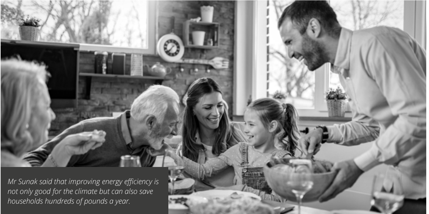
Mr Sunak said that improving energy efficiency is not only good for the climate but can also save households hundreds of pounds a year.